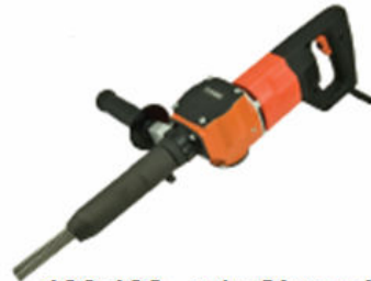
130.132 - w/o Shroud