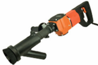
130.232 - w/Flat Shroud