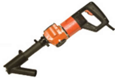
130.332 - w/Inside Corner Shroud